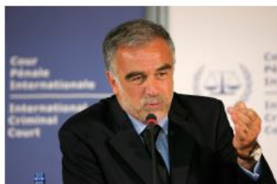
Luis Moreno Ocampo

Genocide Against Armenians in 2023 Expert Opinion